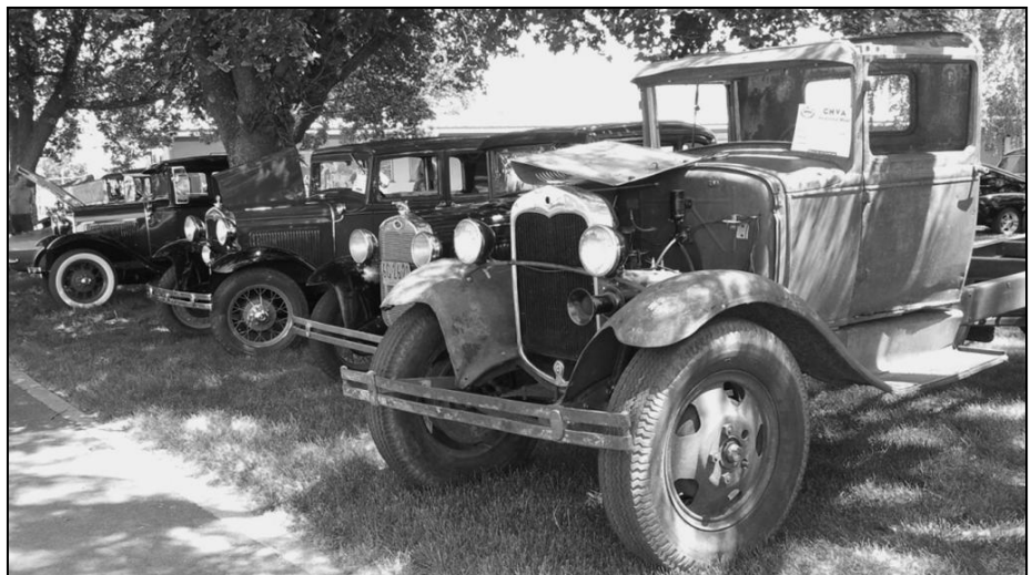
The Sis-Q A's were well represented at the Father's Day show. More photos on page 6