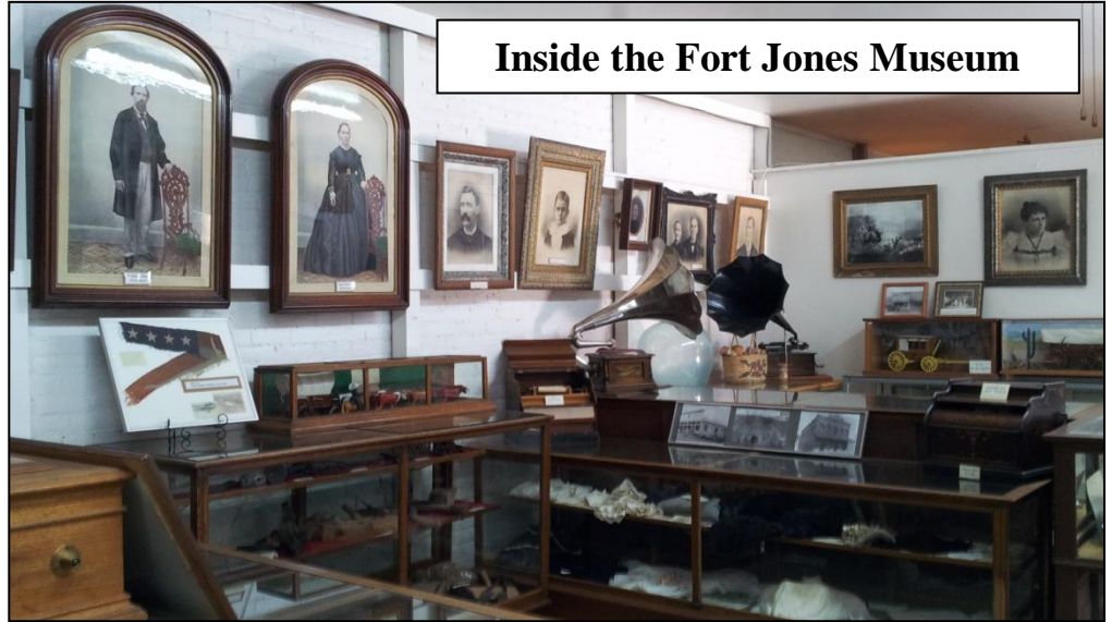
Inside the Fort Jones Museum